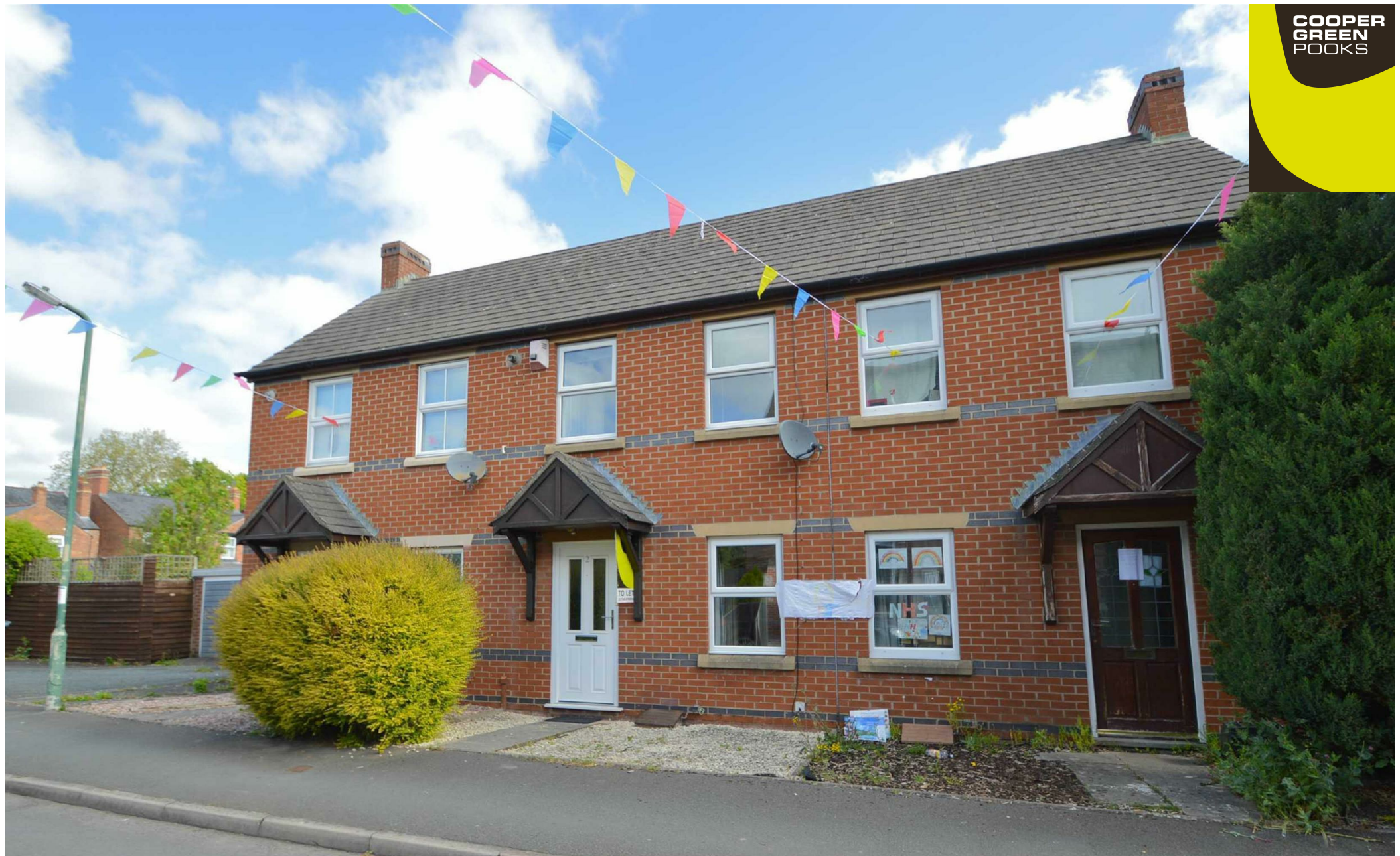
2, Glendower Court, Greenfields, Shrewsbury, SY1 2RG £800 Per Month